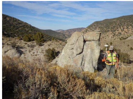
Danbo Tertiary Epithermal Gold Property, Nevada